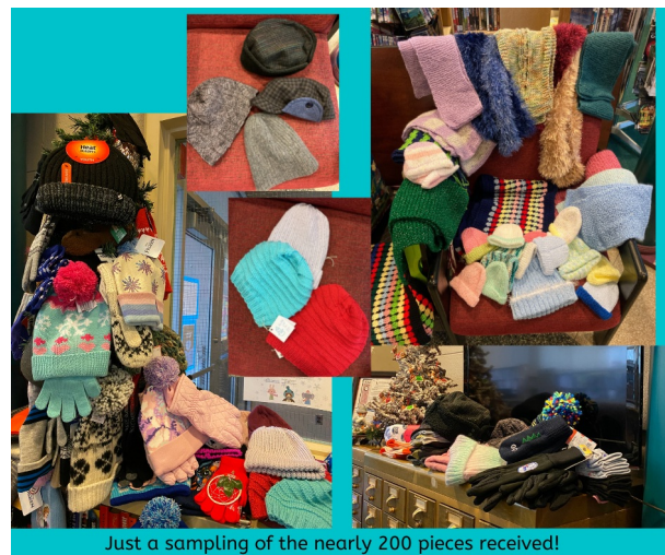
Just a sampling of the nearly 200 pieces received!

The outreach programs we coordinated in the fourth quarter of 2021 shined a light on the power of the people in our community. From our first donations of baby essentials, to fully stocked pantries, to the nearly 200 articles of warmth that were donated, you, our library family, stepped up.