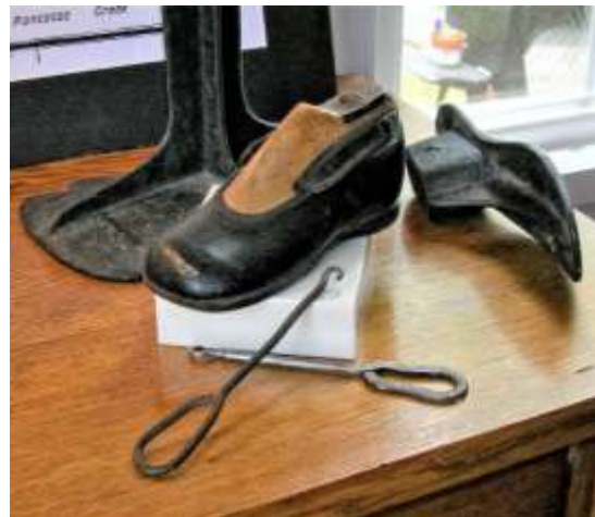
Photo of a shoe actually manufactured by Ridgway & Son Shoes. The shoe is from the collection of Vincent Colonna. The shoemaking equipment was borrowed for the display.