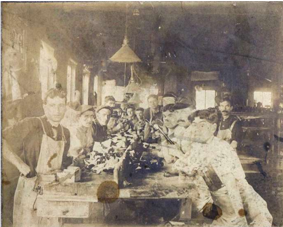
In this photo, the employees appear to be taking a moment from their hard work manufacturing shoes for children and infants. The photo appears to have been taken in the original frame factory building, which would date it between 1885 and 1912.