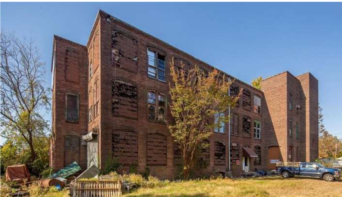
This photo from Bright MLS shows the recent condition of Fisher & Son Canvas when it was still in operation. The original powerplant building and coal shed has long since been demolished and many of the windows have been boarded up. The main entrance is indicated under the awning next to the freight elevator. A bay door can be seen to the rear (south side) of the factory.

Fisher & Son Canvas moved to Cinnaminson in 2018.