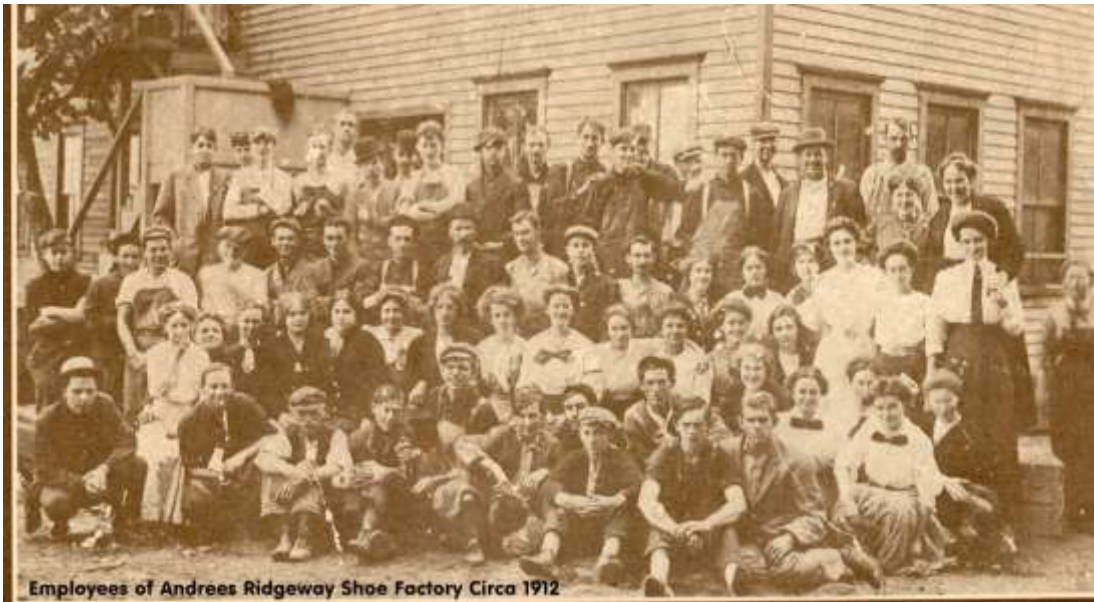
Employees of Andrees Ridgeway Shoe Factory Circa 1912

Ridgeway & Son Shoes was the major employer in Delanco for many years. This annual photo of Ridgeway's employees was taken about 1912 in front of the original frame factory building.