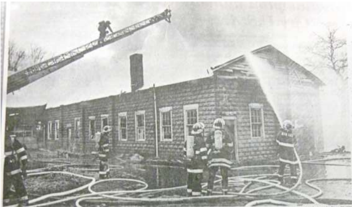
Firemen play streams of water on building of R.H. Gerhardt Co. in Delanco, bringing the blaze under control at 8:40 a.m.

Ridgeway & Son Shoes was the major employer in Delanco for many years. This annual photo of Ridgeway's employees was taken about 1912 in front of the original frame factory building.