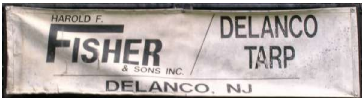
Vinyl sign from the company truck showing both operating names. Peter Fritz photo from 2007.