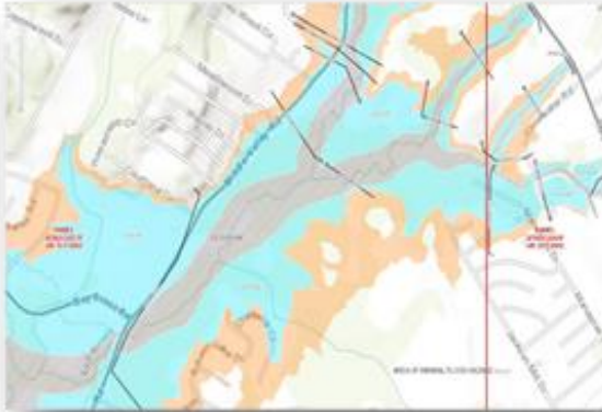
Figure 4: WMS map overlay created from NFHL data.

FEMA's NFHL utility allows you to use Google Earth to view custom combinations of flood hazard information from FEMA's NFHL. View one, several, or all of the layers available in the application, including Special Flood Hazard Areas (SFHAs), Base Flood Elevations (BFEs), insurance risk zones, and other regulatory information.