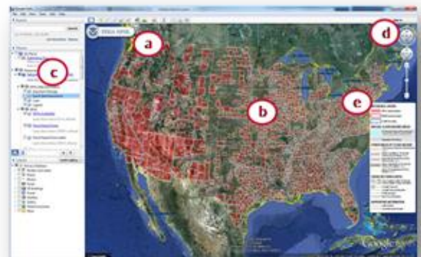
Figure 3: Opening view for the FEMA NFHL utility. Areas of interest include the (a) Quick Start Guide, (b) status map overlay, (c) National Flood Hazard Layer (FEMA) folder, (d) navigation controls, (e) eye altitude readout, and (f) map legend.

FEMA provides two .kmz utilities, either of which may be most suitable, depending on the complexity of your needs. The first is the Stay Dry utility – a simple tool to convey flood risk as concisely as possible to users seeking basic flood hazard information. It is not intended for uses such as precise flood zone determinations.