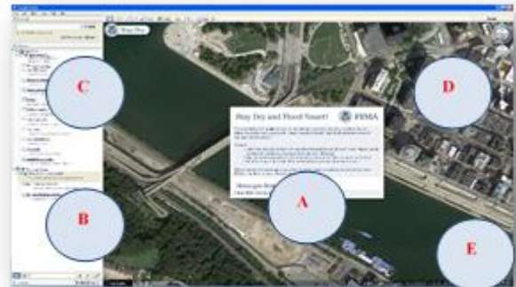
Figure 2: Opening view for the “Stay Dry” application. Areas of interest include the (A) welcome message, (B) “Stay Dry and Flood Smart!” folder in the Places panel, (C) “Search” entry field, (D) navigation controls, and (E) eye altitude readout.

Google Earth™. FEMA offers “.kmz” files for viewing NFHL data in Google Earth ( https://hazards.fema.gov/femaportal/wps/portal/NFHL/WMSkmzdownload ) (see Figures 1 and 2). This capability is simple to use and allows the viewing of basic map overlays. It does not provide access to all NFHL data or reports. To use this capability you need Google Earth installed on your computer, a high-speed Internet connection, and the .kmz files.