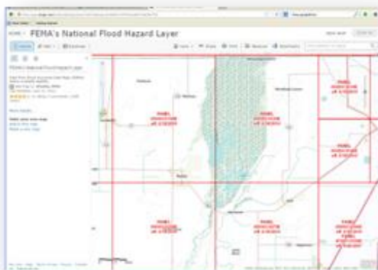
Figure 1: NFHL on the FEMA GeoPlatform, zoomed in to show individual map panels.

FEMA GeoPlatform. The NFHL can be viewed in FEMA's GeoPlatform ( http://fema.maps.arcgis.com/home/webmap/viewer.html?webmap=cbe088e7c8704464aa0fc34eb99e7f30 ). This is the preferred method for using the NFHL, as it is uses base maps that conform to FEMA's regulatory accuracy specifications. View the NFHL GeoPlatform Tutorial ( https://www.fema.gov/media-library/assets/videos/83223 ) to learn how to use the NFHL in the GeoPlatform.